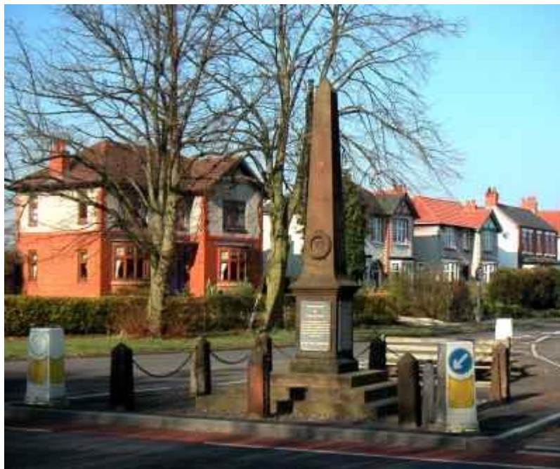
Willaston War Memorial, near Nantwich