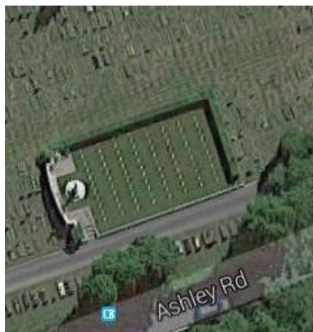
Aerial view of the Screen Wall burials