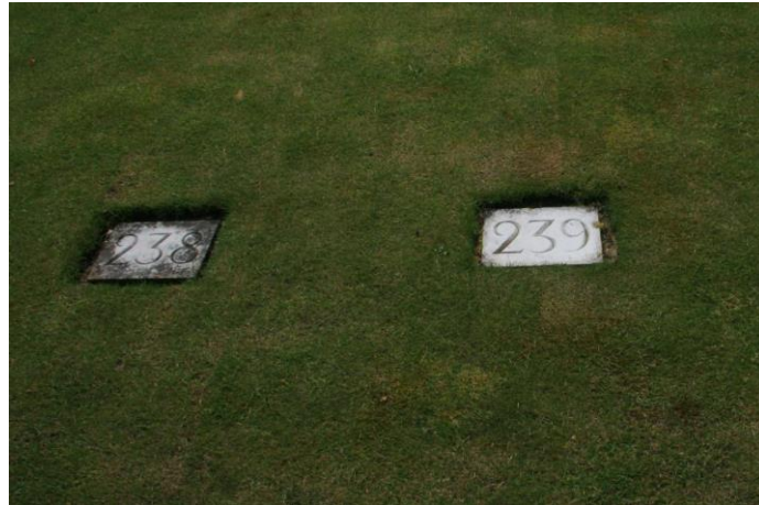
Example showing Private Cummings in Plot 239 & the Numbered Lawn Plaques in front of Screen Wall